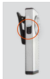
USB charging port