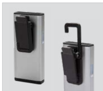
Pocket clip with integrated hook