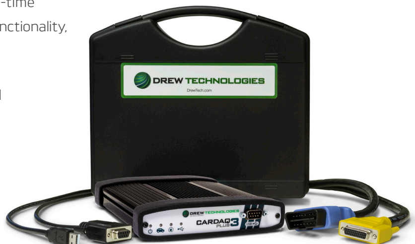
CarDAQ-Plus 3® PART#: ETCP3