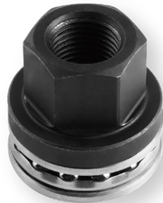
Shoulder nut ( with bearing )