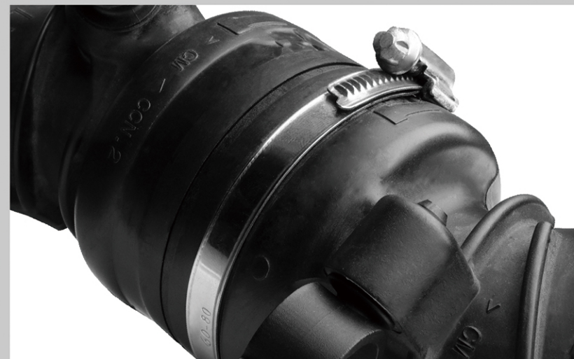
B. For clamp size \varnothing 60~80 mm

Suitable for H4Bt 0.9L petrol turbo engine form 2012