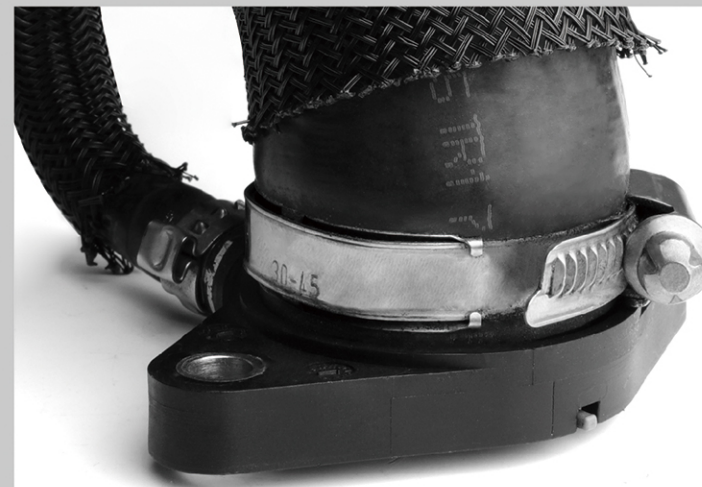
A. For clamp size \varnothing 30~45 mm