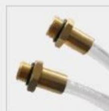
Cylinder Test Kit