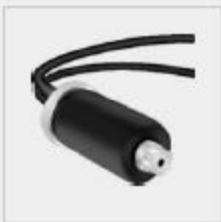
HD Intake Bladder