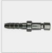
Male Extension coupler