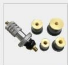
Multi-purpose Test Kit