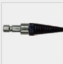
Smoke Nozzle Converter