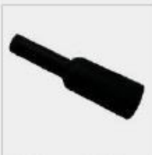
HD Spare Rubber