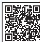
VIEW LIVE DATA