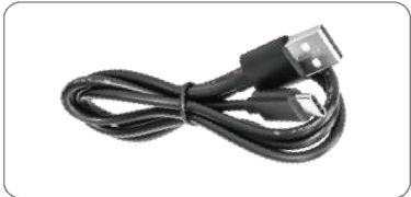
USB TYPE C Cable