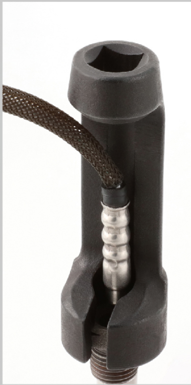
Straight version allows precision re-torque