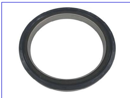
Rear Oil seal : BZ 4938E