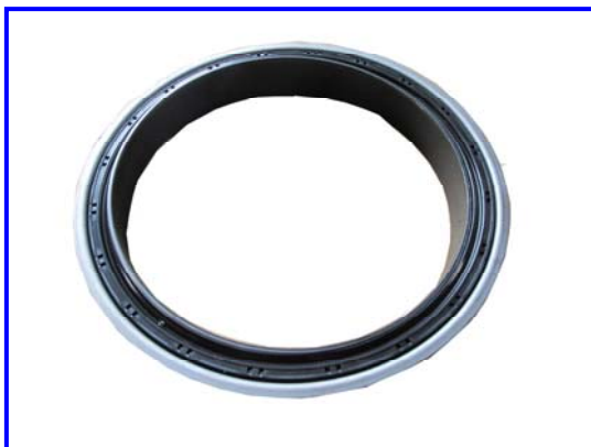
Rear Oil seal : BZ 5333 E