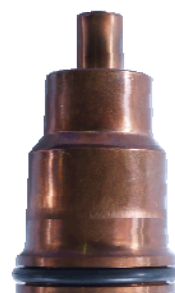
PART NO.: 85124276