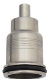
PART NO.: 21515329