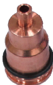
PART NO.: 85104134