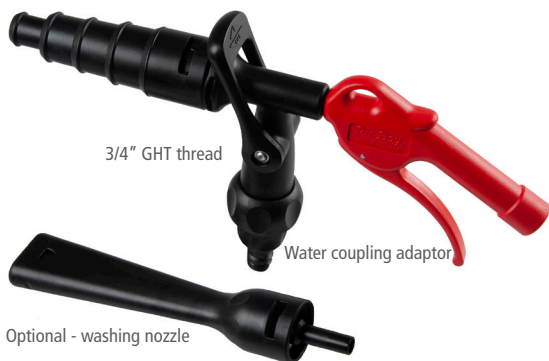
Optional - washing nozzle